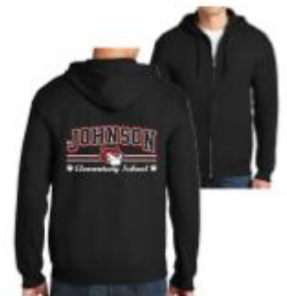
Black Zipper Hooded Sweatshirt