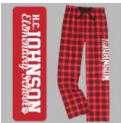
Red & Black Plaid Flannel Pants