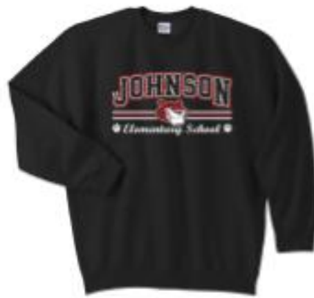
Black Crew Neck Sweatshirt