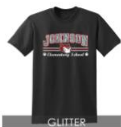
Black T-Shirt w/Glitter