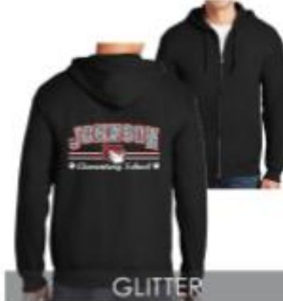
Black Zipper Sweatshirt w/Glitter