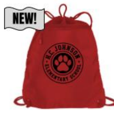
Red String Bag