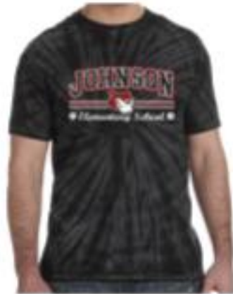
Black Tie-Dye T-Shirt