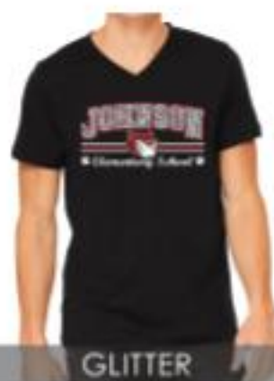
Black V-Neck T-Shirt w/Glitter