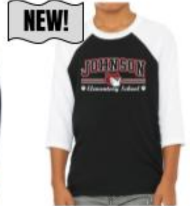
Black & White Baseball Tee