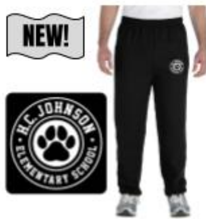
Black Elastic Bottom Sweatpants