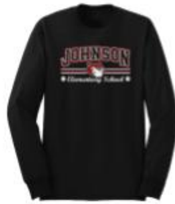
Black Long Sleeve T-Shirt