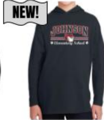
Black Hoodie T-Shirt