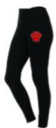
Black Leggings Glitter Pawprint