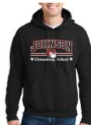
Black Hooded Pullover Sweatshirt