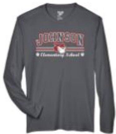
Gray Long Sleeve Dri-Fit Shirt