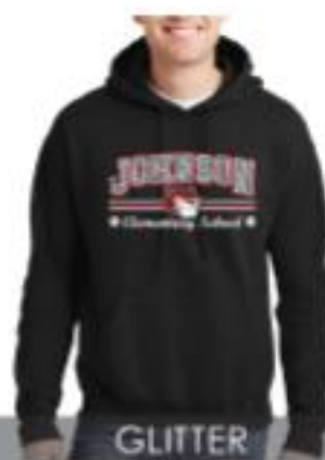
Black Hooded Sweatshirt w/Glitter