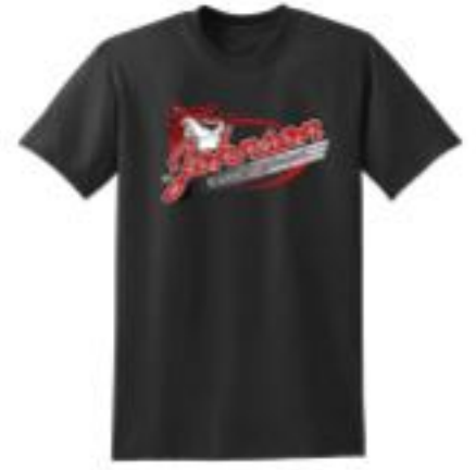
"Old School" Logo T-Shirt (2018-2019)